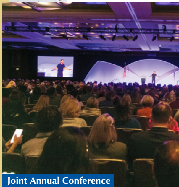
Joint Annual Conference

Diamond sponsorship payments and artwork are due February 28, 2026 , to ensure sponsors receive full year-long sponsor benefits.