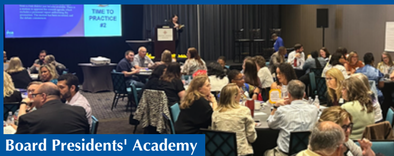
Board Presidents' Academy

Looking for more? Allow IASB's team to put together a sponsorship plan that will get your company noticed at any budget level. Individual event sponsorships opportunities and add-on features are outlined on the following pages.