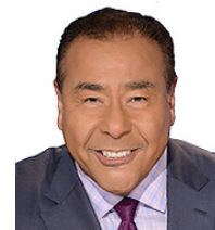
John Quiñones ABC News Veteran, Creator & Host, What Would You Do?

John Quiñones' accomplishments defy the destiny that too many predicted for him. As the child of migrant farm workers who entered school not speaking English, Quiñones later found himself put into a vocational track, despite his dream of going to college. In high school, he finally found a helping hand: an English teacher who recognized that the talented young man had what it takes to become the first in his family to attend college. By believing in Quiñones and entering him into the federal Upward Bound program, one teacher put him on a path that literally changed the trajectory of his life. In this moving presentation, John Quiñones inspires all of us to believe in our own potential, the transformative power of education, and how one person can make a difference in the future of a child.