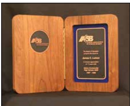
16) WALNUT BOOK DEEP ETCH (6x8 in.) Walnut book features individual's initials on front, the IASB logo or your school logo (provide black & white logo) on inside front cover, and a deep etched copper plate on blue velour background.