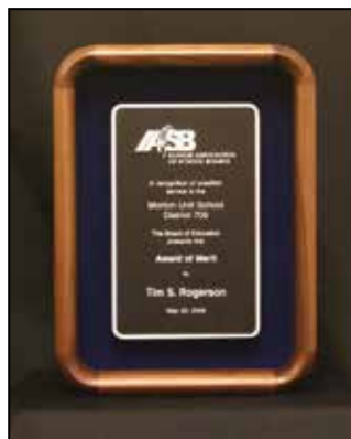
15) WALNUT ROUNDED FRAME SHADOWBOX (9x12 in.) Rounded corner frame with a deep etched zinc plate mounted in three dimensional style on a blue velour background.