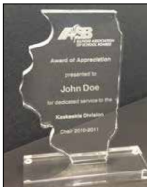
11) STATE OF ILLINOIS (7 in.) Engraved glass.