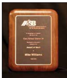
Photo transfer application on polished brass plate, mounted on walnut base.