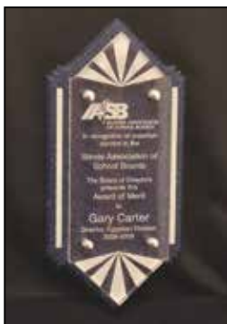
6) MONARCH COLLECTION PLAQUE (6x13 in.) Engraved clear acrylic with accents, projection mounted on a dark blue corian base.