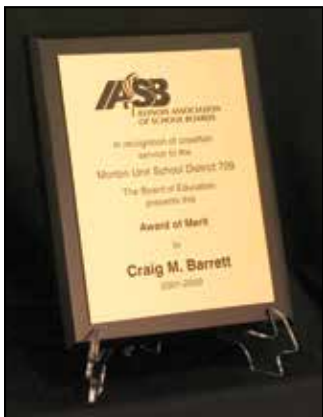
14) BEVELED EDGE PLAQUE (8x10 in.) Reverse etched brass plate on an ebony base (pictured), a reverse etched zinc plate on a walnut base, or a deep etched copper plate on a natural oak base (not pictured).