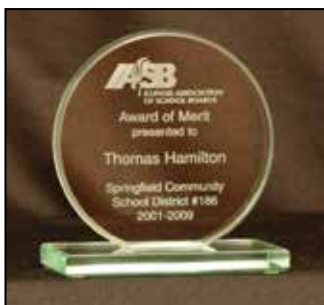
10) JADE GLASS CIRCLE (4 in.) Freestanding engraved jade glass circle.