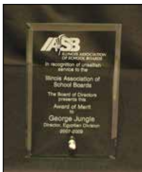
9) GLASS UPRIGHT (4x6 in.) Freestanding engraved glass with beveled edges.