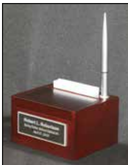
12) DESK SET (4.5W x 4D x 3H.) Rosewood desk set with an etched zinc plate (3½x1¼ in.).