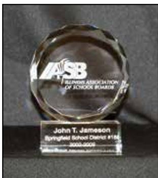
8) CRYSTAL SUNBURST (4x5 in.) Face engraved solid crystal sunburst.