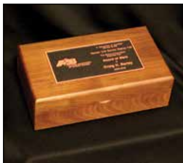
13) WALNUT CARD BOX (9¼x5¼ in.) Deep etched copper plate (6x3 in.) mounted on hinged lid of walnut box.