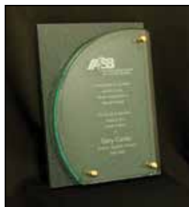
7) OMEGA COLLECTION PLAQUE (9x12 in.) Engraved jade acrylic, projection mounted on a dark green corian base.