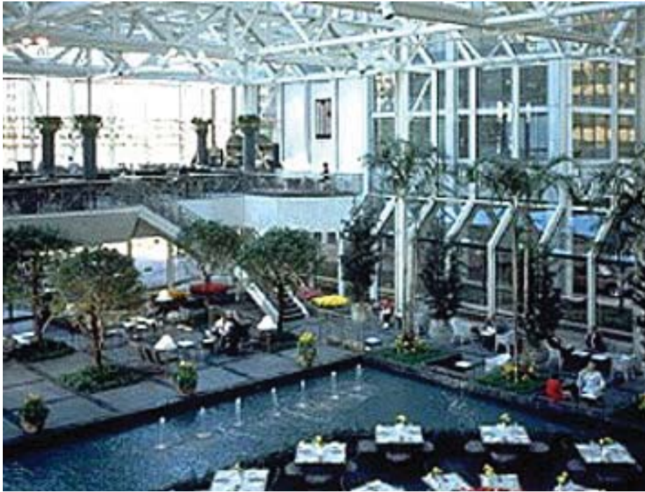
Conference goers enjoy meeting in the jewel-box atrium that is the Hyatt's lobby.

takes to consolidate or annex, what legal steps have to be followed, and the financial pros and cons to consider.